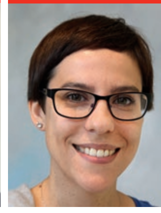
Teaching French Public Law